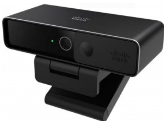
Figure 1. Cisco Webex Desk Camera

Powered by the Cisco Webex® platform, the Webex Desk Camera is a fully managed IT asset with centralized device management and insights. It also offers a Webex Desk Camera app for any Windows or MacOS users to do professional camera settings, firmware upgrade and troubleshooting.