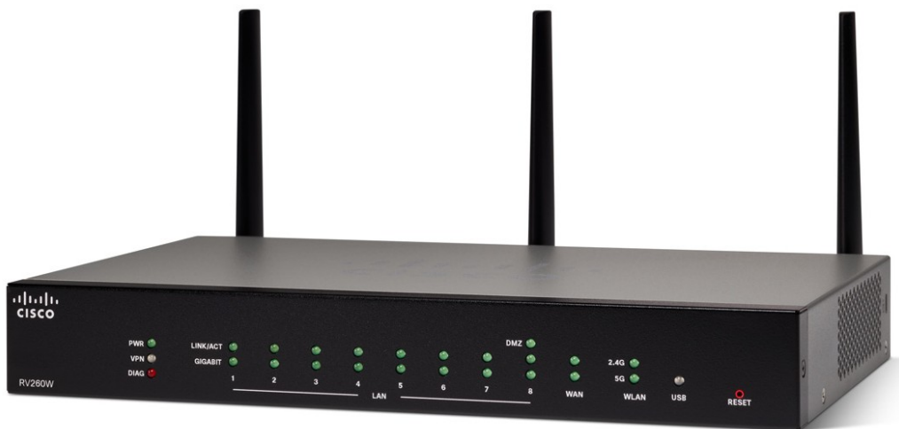
Cisco RV260W Router