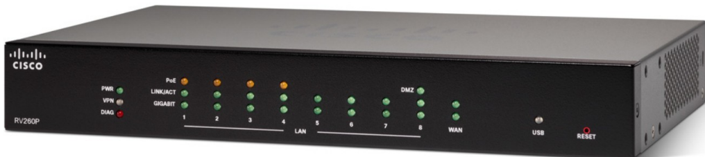
Cisco RV260P Router