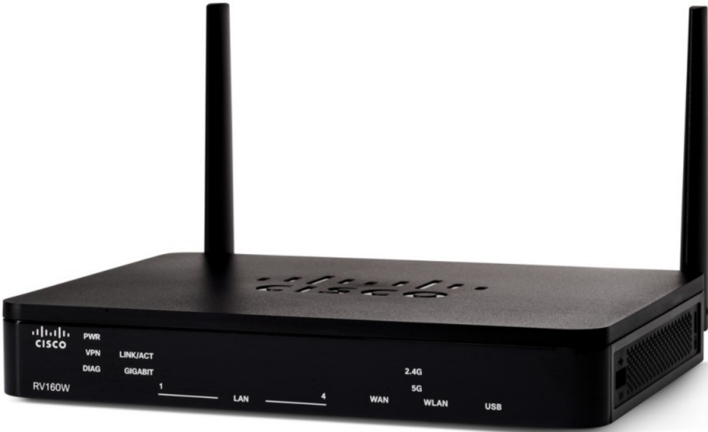
Cisco RV160W Router