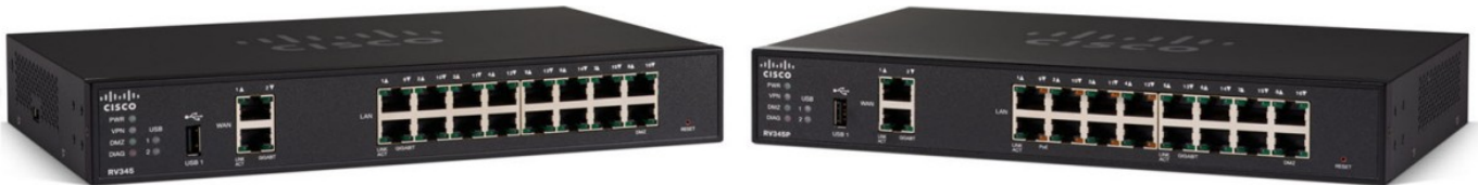
Cisco RV345/RV345P Router