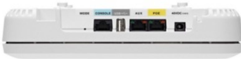
Figure 1: Ports of Cisco 1800 series Access Points

A port is a physical entity that is used to connect Cisco 1800 series access points to the network. The ports available on Cisco 1800 Access Points are as shown.