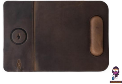
CIAO TECH CF9080 Wireless Charging Mouse Pad