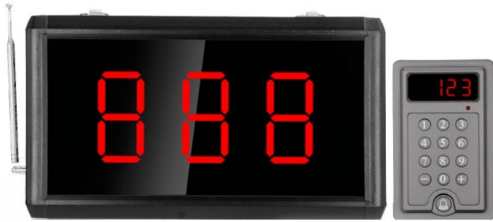
CKO01-Wireless Queue Calling System User's Manual