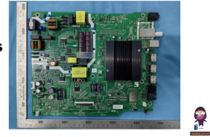
Chuangwei T7663B2 Wi-Fi Plus Bluetooth Module