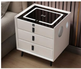
Charniol B09WYPXDCS Smart Bedside Table USB Three Color Light