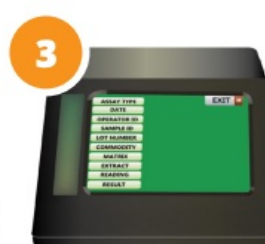
Read Results in Less Than 5 Seconds