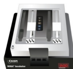
For Batch Processing

Incubate multiple strips simultaneously, then read results in the Charm EZ-M system.