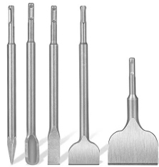
CGBOOM 5 Piece Chisel Set