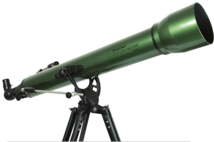
EXPLORASCOPE 80AZ Model #22102