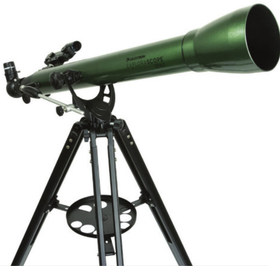
EXPLORASCOPE 60AZ Model #22100