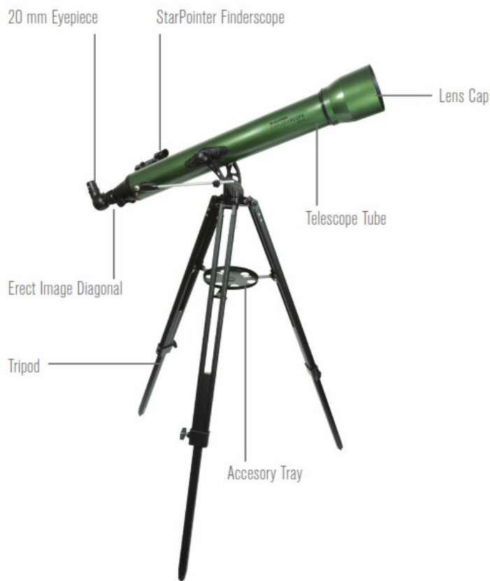
EXPLORASCOPE 60AZ, 70AZ, and 80AZ