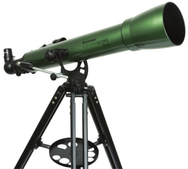
EXPLORASCOPE 70AZ Model #22101