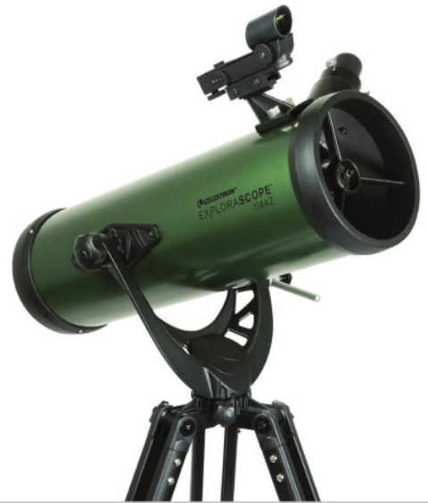
EXPLORASCOPE 114AZ Model #22103