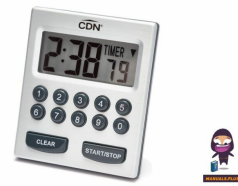
CDN TM30 Direct Entry 2-Alarm Timer