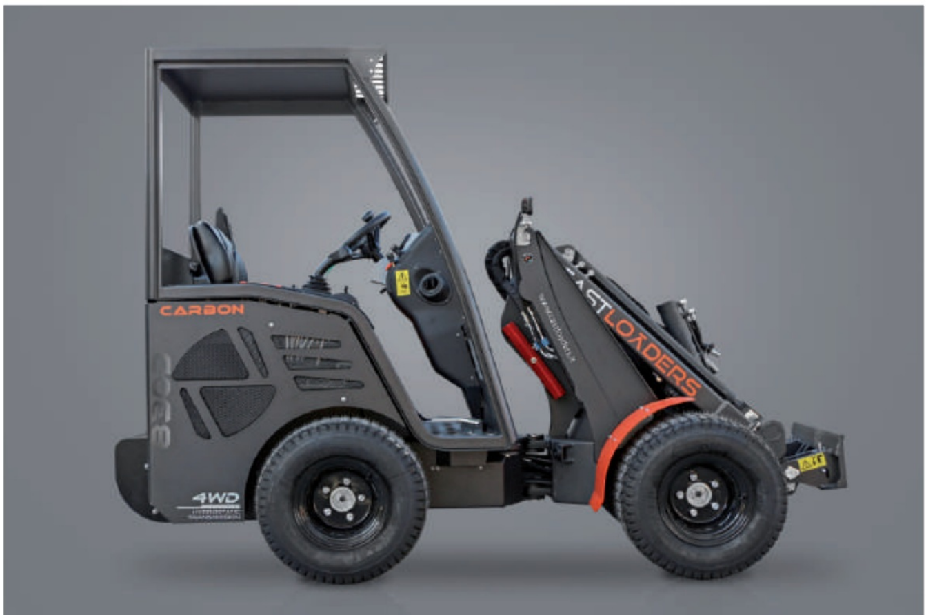
Compactness and solidity