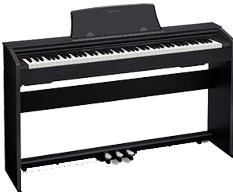
PX-765/AP-265 MIDI Implementation CASIO COMPUTER CO., LTD.