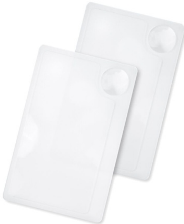
WM-21 2.5x Magnifier and 6x Spot Lens

Congratulations on selecting your new Emergency Fire Starter! In order to achieve optimum performance, please follow instructions for proper use and care.