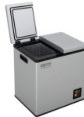
PORTABLE FRIDGE CR 8076