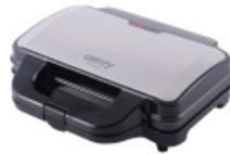
SANDWICH MAKER CR 3054