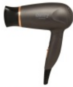
HAIR DRYER CR 2261