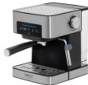
ESPRESSO MACHINE CR 4410