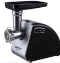
MEAT MINCER CR 4812