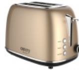
TOASTER 2 SLICES CR 3217