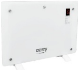
GLASS HEATER CR 7721