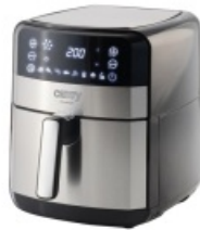
AIR FRYER OVEN CR 6311