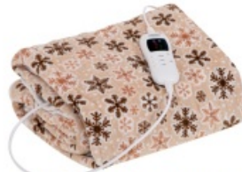
HEATING UNDERBLANKET CR 7430