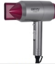
HAIR DRYER CR 2256