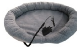
HEATED ANIMAL DEN CR 7431