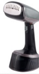
GARMENT STEAMER CR 5033