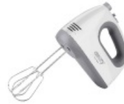
MIXER CR 4220