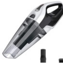
BAGLESS VACUUM CLEANER CR 7046