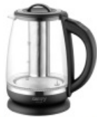
ELECTRIC KETTLE CR 1290