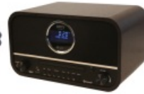
RETRO RADIO CR 1182