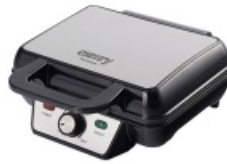
WAFFLE MAKER CR 3046