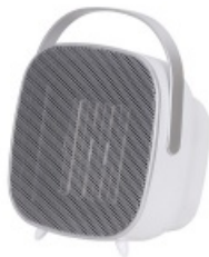
CERAMIC FAN HEATER CR 7732