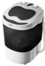
WASHING MACHINE CR 8054