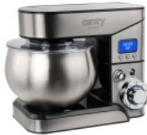
FOOD PROCESSOR CR 4223