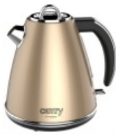
ELECTRIC KETTLE CR 1292