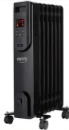
OIL FILLED RADIATOR CR 7812