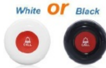
Call Button (5/10 PCS) (white/black) Contained Battery