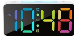
Rainbow Color Changing