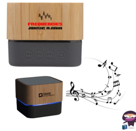
cadence GC6026 Bluetooth Speaker