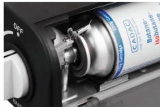
BAYONET CARTRIDGE 227G *Safari Chef 30 Compact