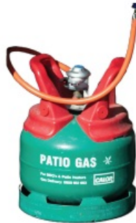
REFILLABLE GAS CYLINDERS - OVERFLOW LEVEL INDICATOR WITH QR