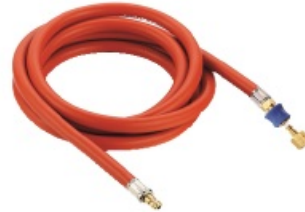
EXTERNAL HOOK UP ON A LEISURE VEHICLE *Not compatible with a Bullfinch hook-up

HP (DIRECT) PRESSURE SCREWS DIRECTLY INTO UNIT