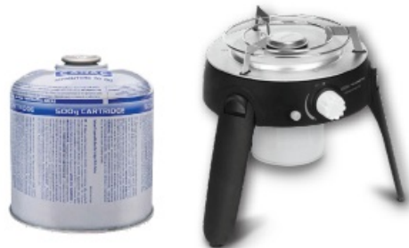
THREADED CARTRIDGE 500G *Safari Chef 30 HP

HP (DIRECT) PRESSURE SCREWS DIRECTLY INTO UNIT