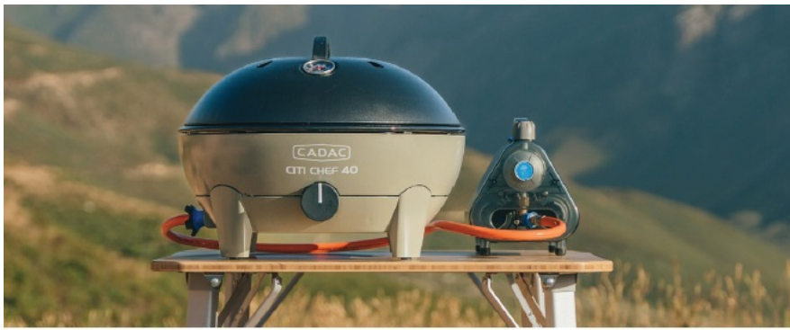
370-QR Quick Release Fitting