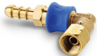
338-2 90 ° Rotating Quick Release