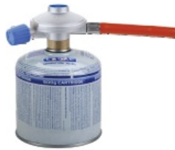
THREADED CARTRIDGE REGULATOR