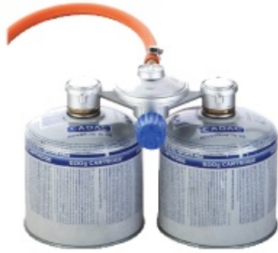
DUAL POWER PAK