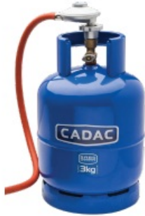
REFILLABLE GAS CYLINDERS - 2M HOSE & CLAMP