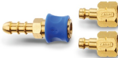
338-1 2 Nut Quick Release