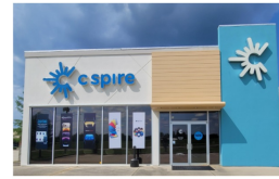
C spire 202307 Downloadable Contract