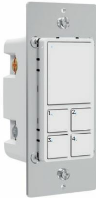
Model – WFN5002M,81914