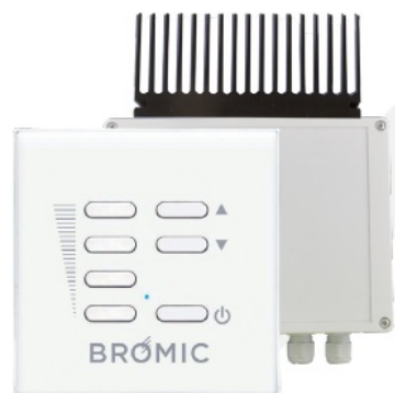
Bromic Dimmer Controller