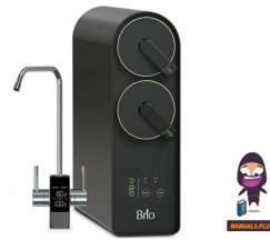
Brio TROE600COL Filter System