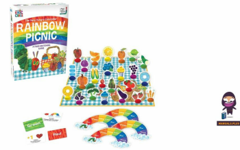
BRIARPATCH 01467 Rainbow Picnic Game