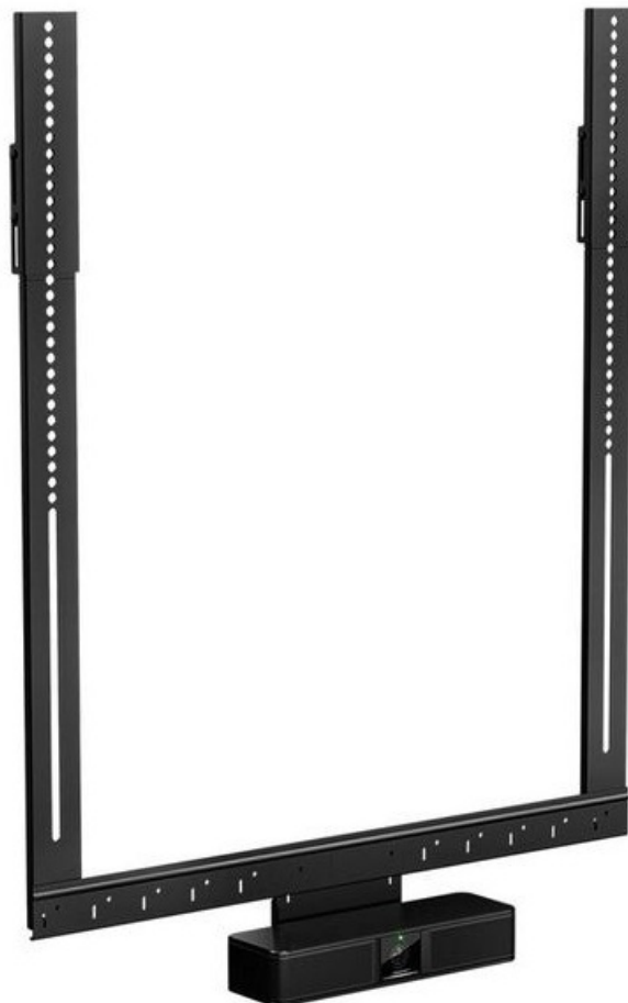
VIDEOBAR DISPLAY MOUNTING KIT

Please read and keep all safety and use instructions.