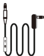
Audio cable with smart remote and mic