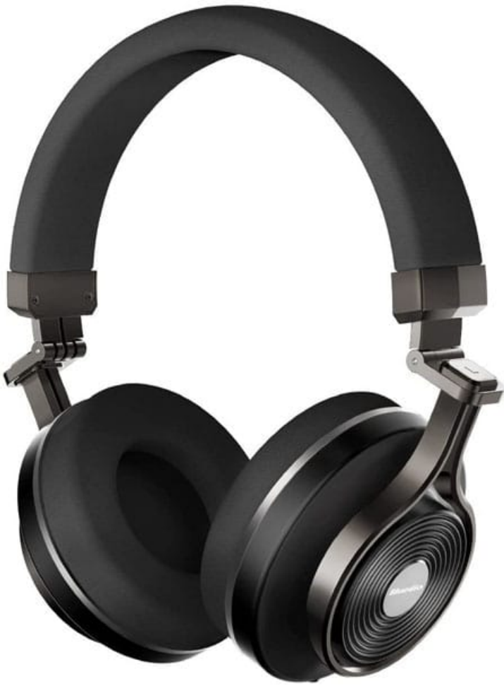
Bluedio Headphones Model: T3-WH