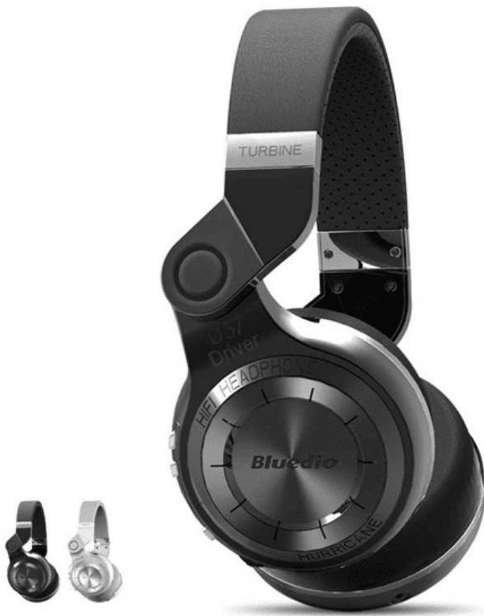
Bluedio Wired Headset Model: T2