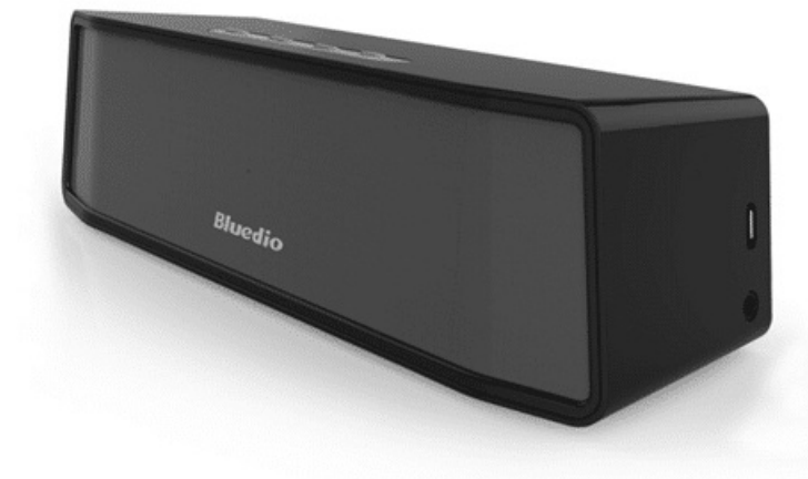
Bluedio Bluetooth 4.1 Speaker Model: BS-2