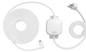
blink Weather Resistant Power Adapter