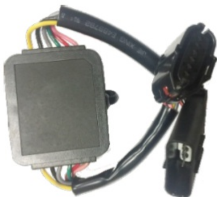
power module host