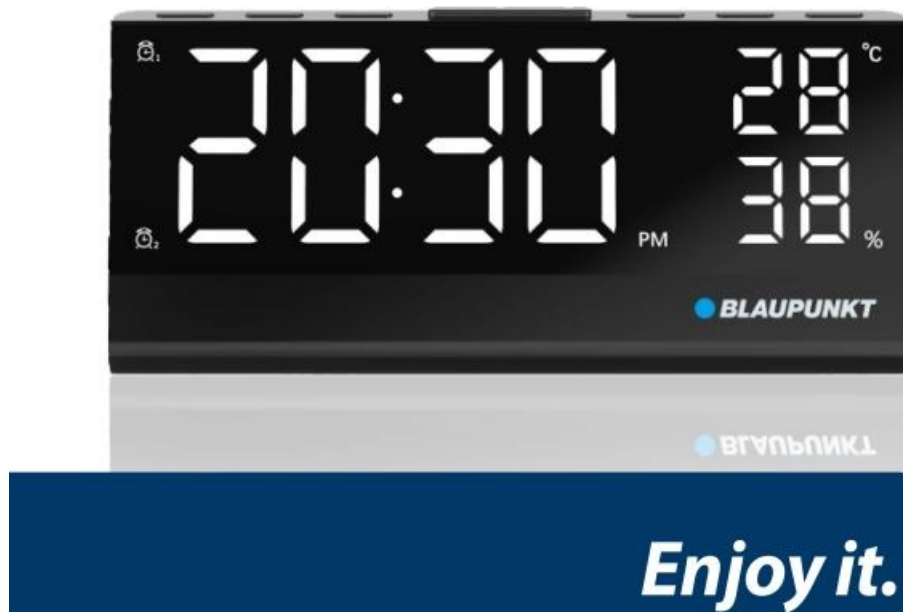
Alarm clock radio with indoor humidity and temperature