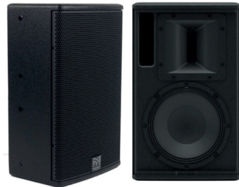
Blackline X8 Ultra-Compact Passive Two-Way System PORTABLE + INSTALLATION