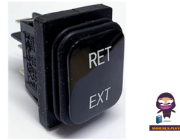
BLACK JACK EXT-RET Replace Switch