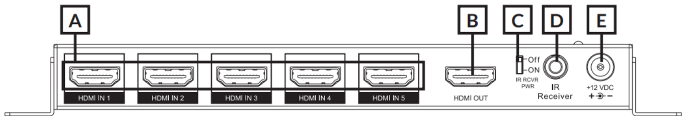
FIGURE 2: Rear Layout