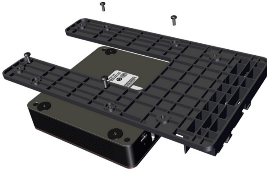
Figure 2. Bracket Removal