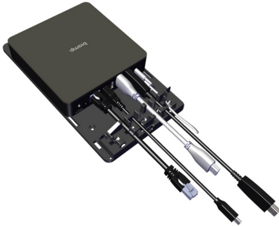
Figure 4. - Node and Hub with cables and management tray