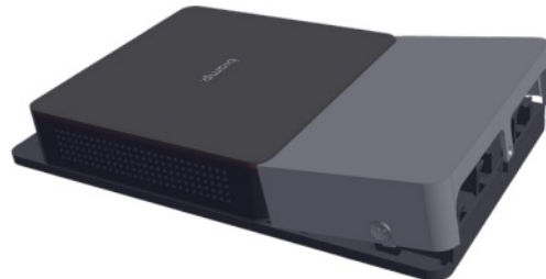
Figure 6. - Node and Hub with cables and management tray