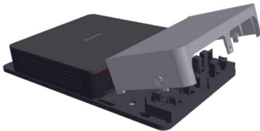
Figure 5. - Node and Hub tray cover