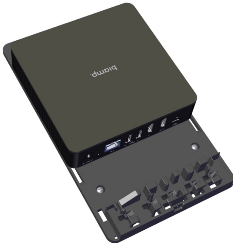
Figure 1. Modena Node X 100 and Hub X 100 with Bracket

A wall-mount bracket comes installed on the device and may easily be removed. The following hardware is included for mounting the Node/Hub with the attached bracket.