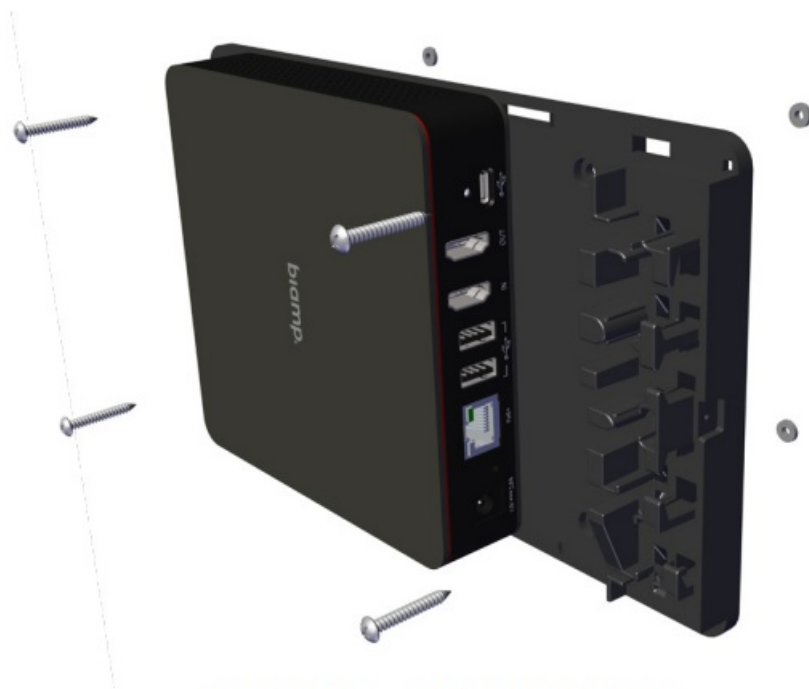
Figure 3. - Wall installation