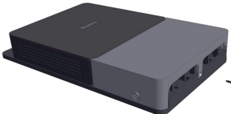
Figure 7. Secure cover