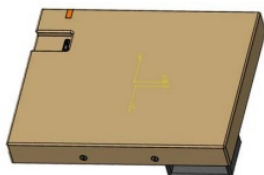
Wireless charger Unit