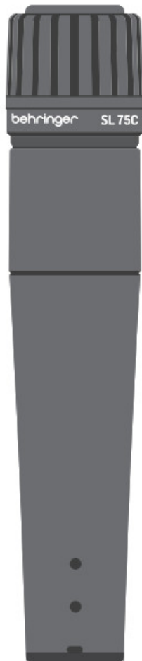
SL 75C Dynamic Cardioid Microphone