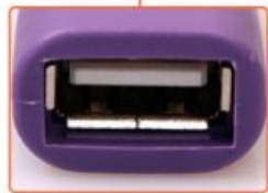
USB Type A Female