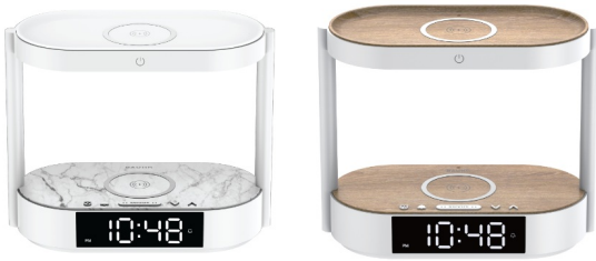
BAUHN® Dual Wireless Charging Clock