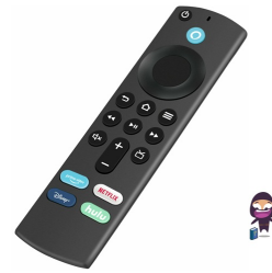
Baiyun Baiyun L5B83G Voice Remote Control