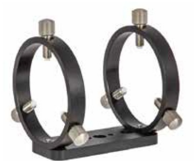
Guidescope rings and base plate without the RDM, e.g. for rails with Mini-Weaver-dovetail.