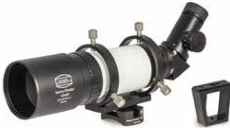
Example of use: Baader Variofinder with MQR IV in Low-Profile-Configuration.

Zur Sternwarte 4 • D-82291 Mammendorf • Tel. +49 (0) 8145 / 8089-0 • Fax +49 (0) 8145/8089-105