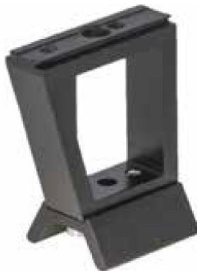
The RDM with dovetail for standard finder bases.