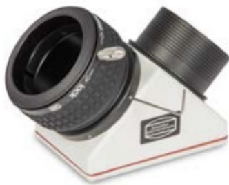
Remove 2" ClickLock® with an Allen wrench

The 2" ClickLock®-clamps of our 2" star diagonals and the Herschel Wedge (see below) can be removed. For this, you need to remove the small screws, as shown here for the BBHS® mirror diagonal # 2456115, or in the case of the Herschel, you need to