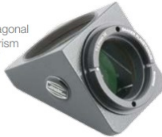
T-2 / 90° star diagonal with 32 mm Prism #2456095