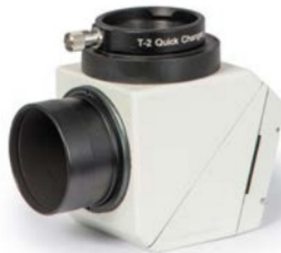
Herschel Wedge with TQC Quick-Changer