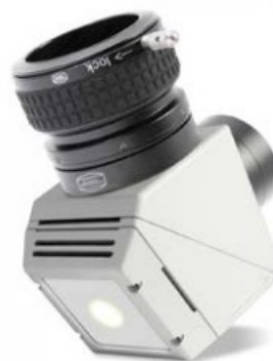
Safety Herschel Wedge #2956500P / #2956500V