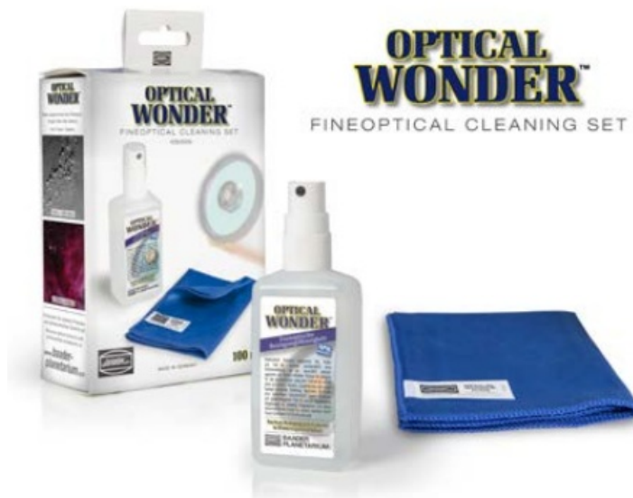
Baader Optical Wonder Cleaning Fluid and Micro Fibre Cloth are also available as set. Item-Nr.: #2905009

Do NOT try to disassemble the nonviewer and do NOT try to clean it inside!