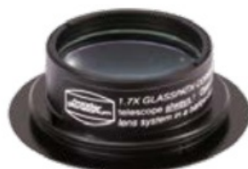
T-2 Glasspath Corrector Factor 1,7 #2456316(Z)