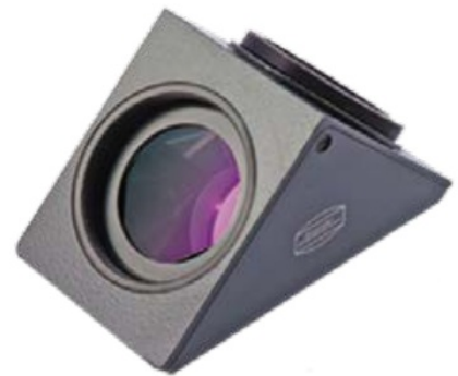
T-2 / 90° Amici-Prism with BBHS® coating #2456130