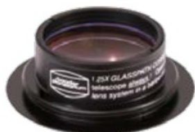
T-2 Glasspath Corrector Factor 1,25 #2456314(Z)

GPCs to be inserted into star diagonals or MaxBright® II body