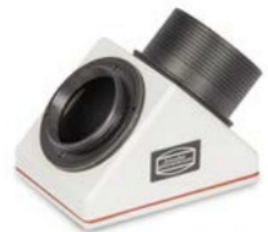
Mirror diagonal with threaded 2" / T-2-Adapter

unscrew the clamp. Then you can access a female 2"-SC-thread, into which you can screw the 2"-SC/T-2-adapter # 1508035. The glasspath corrector is inserted into the 2"-SC/T-2-adapter.