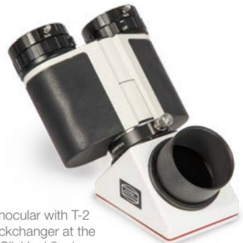
Binocular with T-2 quickchanger at the 2"-Clicklock® mirror diagonal