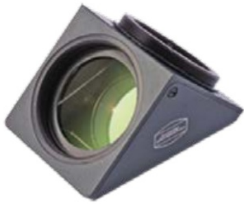
T-2 / 90° star diagonal (Zeiss) Prism with BBHS® coating #2456095