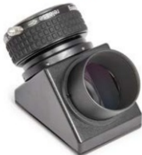
Baader 2" BBHS® prism diagonal with 2" ClickLock®-clamp #2456117