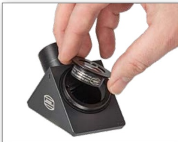
Inserting the glasspath correctors 1,25x, 1,7x and 2,6x into the Baader T-2 star diagonals.