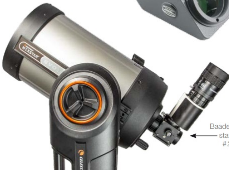
Baader FlipMirror II star diagonal #2456100