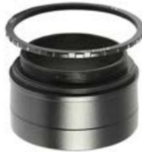
# 2408150 2" nosepiece