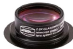
T-2 Glasspath Corrector Factor 2,6 #2456317