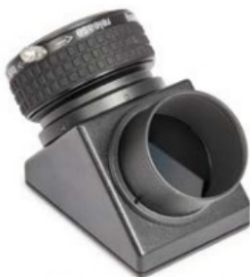
Baader 2" BBHS® mirror diagonal with 2" ClickLock®-clamp #2456115