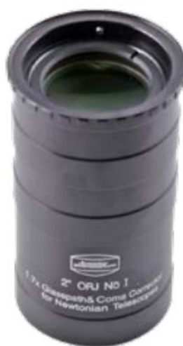
#2456300 1,7x GPC and coma corrector for Newtonians