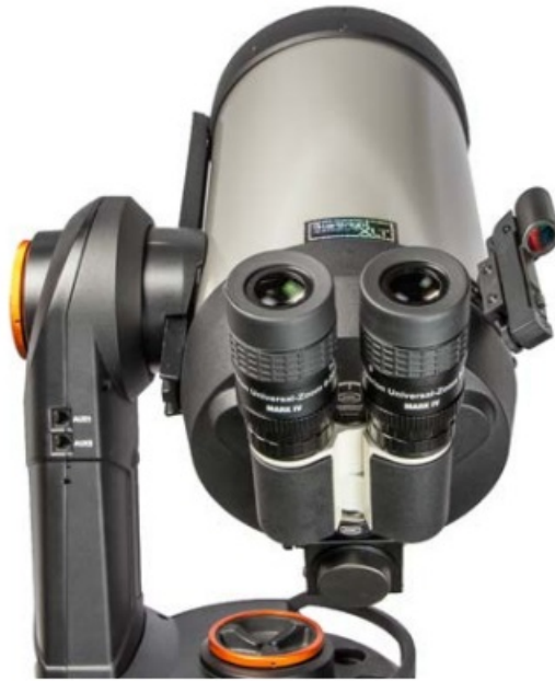
MaxBright® II Bino-viewer with FlipMirror II Star Diagonal and two Hyperion® Universal Zoom Mark IV eyepieces on a Schmidt-Cassegrain.