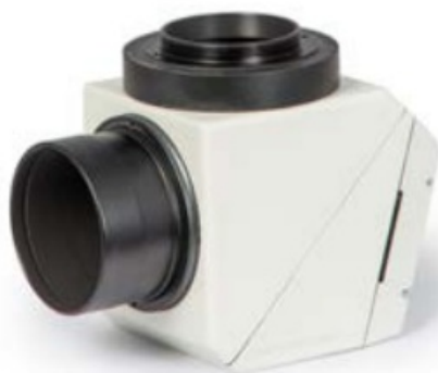
Herschel Wedge without Clicklock®, but with T-2-adapter #1508035.

The glasspath correctors 1,25 and 1,7 are to be screwed directly into the binoviewer, without the black plastic ring. The 2,6 glasspath corrector must be put into the SC/T-2-adapter # 1508035 together with the black spacer ring. It is locked in place by the quickchanger and the dovetail ring of the binoviewer. You can find a detailed description in the manual of the Herschel Wedge.