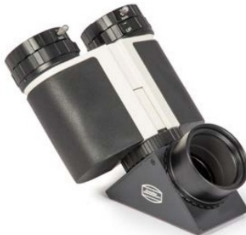
MaxBright® II Bino with 1¼" star diagonal and 2" nosepiece

Please note: If the dioptic difference between your eyes is very large (more than 5 – 6 diopters), you may find that even with one eyepiece holder adjusted fully in and the other fully out, you cannot bring both to focus. If so, you may want to view while wearing your eyeglasses. Alternatively, you may unlock the eyepiece in the fully extended holder and lift it out a few millimeters to compensate for the strong difference between your eyes.