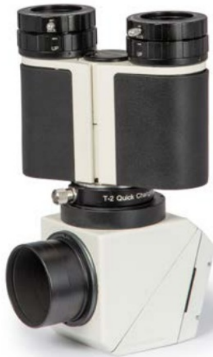
Binoviewer and glasspath corrector on the Herschel Wedge

CAUTION: If you mount a glass path corrector inside the SC/T-2-adapter # 1508035, it will hit the filter which is also screwed into the adapter. This is always the case with the 2,6x GPC, but also with the other GPCs, if you do not use the Zeiss micro bayonet. If you use a GPC in the SC/T-2-adapter, you must not screw the 2" filters completely into the adapter.