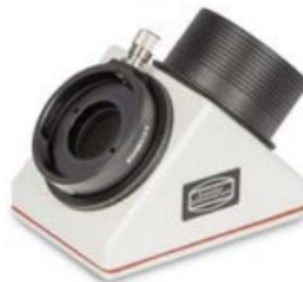
Star diagonal with optional T-2 quick-changer