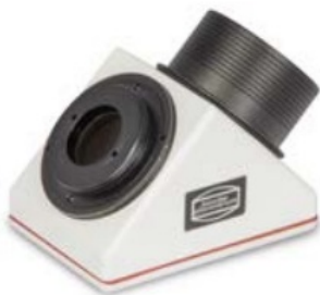
Star Diagonal with T-2 adapter and glasspath corrector

Now you can attach the MaxBright® II either directly to the prism with the T-2 counter nut, or you attach the optional TQC quickchanger # 2456313A to the housing, to use the Zeiss microbayonet.