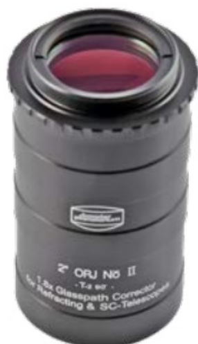
#2456305 1,8x GPC for Refractors and Schmidt-Cassegrain

A Baader Glasspath Corrector (GPC) fulfills two critical roles. Firstly, it corrects the glass path – that's the amount of glass through which light passes on its way through the prisms and which causes chromatic aberrations (colour errors) with fast telescopes. Secondly, the GPC magnifies the focal length and moves the focal point of the main telescope. You will find more information about choosing the right compensator in the addendum starting at. The GPCs with a Z in the part number are for use with the Zeiss microbayonet. They are inserted "upside down", directly into the nonviewer.