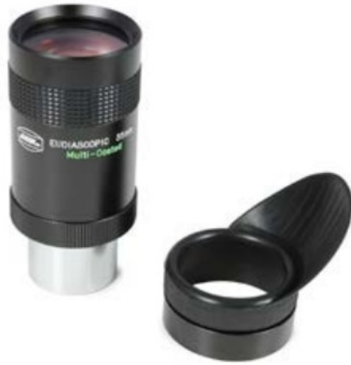
The Eudiascopic 35mm-eyepieces show a very large field of view, in spite of having only a 1¼" nosepiece.

The maximum outside body diameter of eyepieces that can be used with the nonviewer is about 58 mm. If the nonviewer is used with eyepiece having a larger diameter, for example the Pentax XW, you may have problems reaching the correct separation between the two eyepieces if the interpupillary distance between your eyes is less than 60 mm.