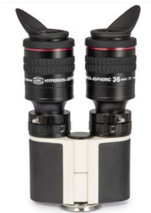
Two 36 mm Hyperion® Aspheric at the MaxBright® II Binoviewer