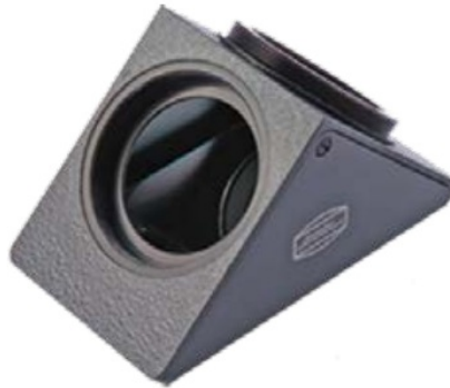
T-2 / 90° Maxbright mirror diagonal #2456100