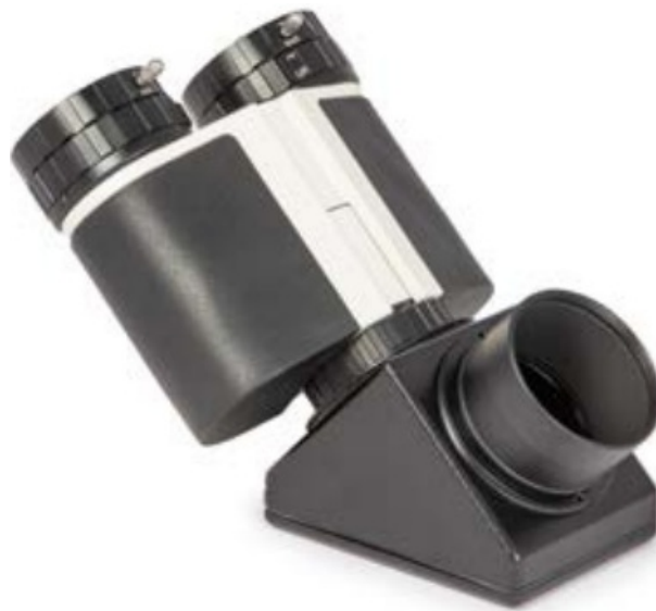
MaxBright II with 2" BBHS® star diagonal #2456115