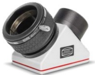
Baader 2" ClickLock® mirror diagonal with 2" ClickLock®-clamp #2956100