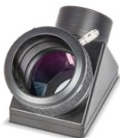
Baader 2" Astro-Amici Prism with BBHS® coating #2456120