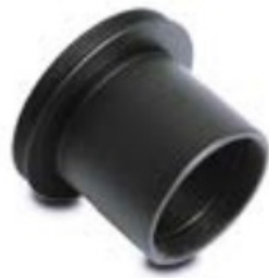
# 2458105 1¼" nosepiece

A T-2 nosepiece in 1¼" (31,8mm, # 2458105) or 2" (50,8 mm, # 2408150) is used to connect the binoviewer either through the pre-installed T-2 coupling nut or the optional TQC quick changer with a focuser/eyepiece clamp. They can also be used to use a T-2 star diagonal at 1¼" or 2" focusers.