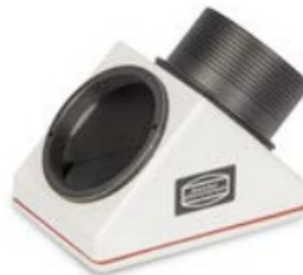
Mirror diagonal with revealed SC-thread