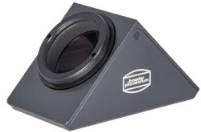
T-2 BBHS® mirror star diagonal #2456103