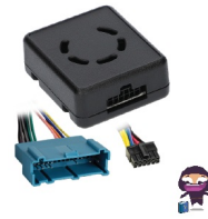
AXXESS AXDI-GM3 Wiring Interface