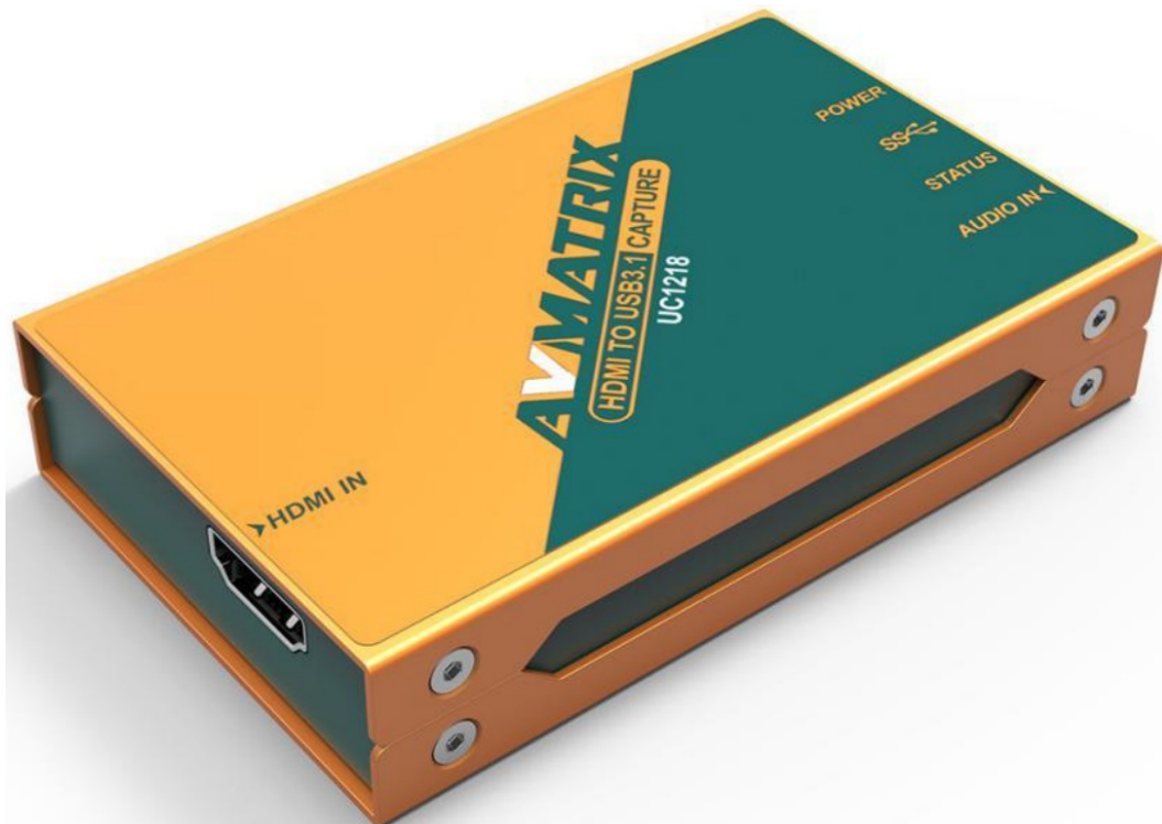
HDMI to USB3.1 Gen 1 Video Capture User Manual V1.0