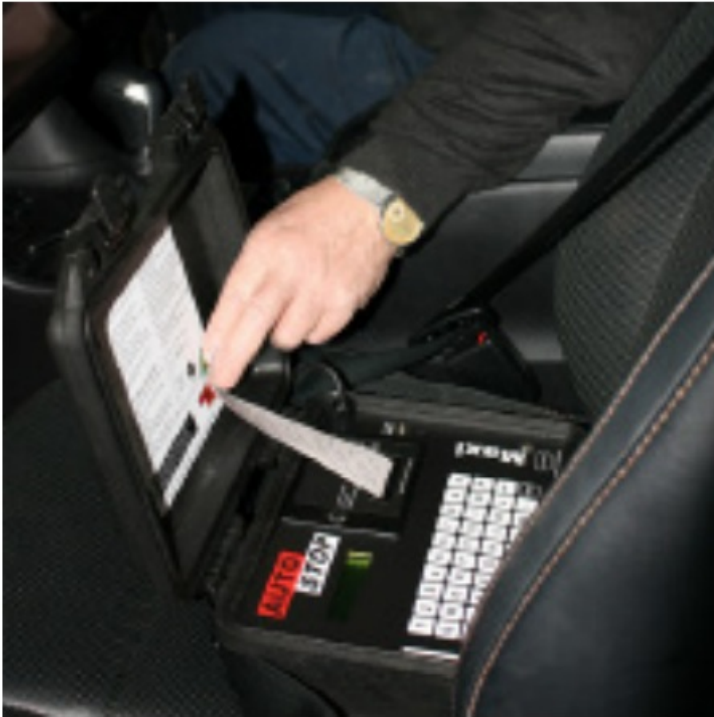
Figure 1: AutoStop brake meter in position ready for testing. Secure in position before turning on and starting any testing.

You can download the latest version of our product manuals on the AutoTest website.