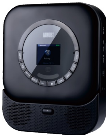
Portable CD and MP3 Player with Bluetooth