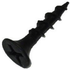
2x CONNECTOR 024