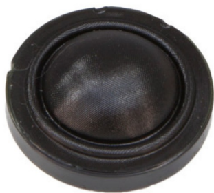
2x CONNECTOR 017