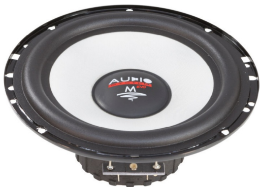
2x FWK TW