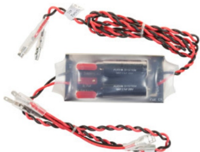
2x HS24 INSTALL EVO2